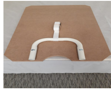
Step 3: Insert Support Handle (B) into the pre-assembled base plate (A), pressing in snap button and snap bolt. Ensure that both snaps are fully extended through holes. Secure safety nut to fully extended snap bolt with wrench (C.)